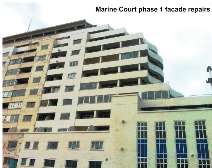
Marine Court phase 1 facade repairs

For further information on the operational range of services provided by Cemplas please visit www.cemplas.co.uk .